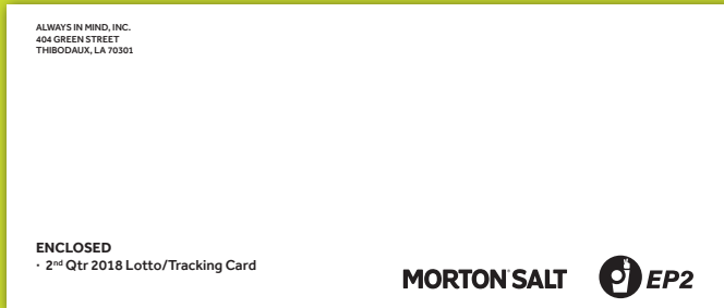
Envelope containing tri-fold learner/tracking card

Each quarter your employee will receive an envelope in the mail which contains their Learner/Tracking card. The envelope can also be distributed at your worksite.