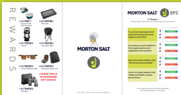
Learner card front/reward gift selection tab