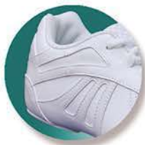
Low profile hidden midsole.