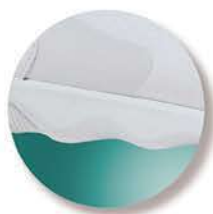
Patented Finger Grooves™ and heel notch.