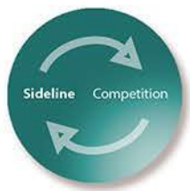
Crossover from sideline to competition with perfectly blended weight, shock absorption, flexibility and support.

Cross over seamlessly from sideline to competition with perfectly blended weight, shock absorption, flexibility and support.