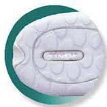
Low weight and easy to grip.