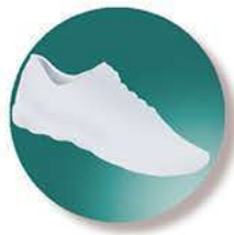
Seamless upper and new sleeker last.