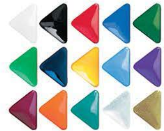
Patented Snap-In color logo system.