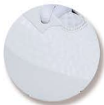
100% tactile Touch Technology.

Women's Sizes: 4-11, 12, 13, 14 Youth Sizes 10, 11, 12, 13, 1, 2