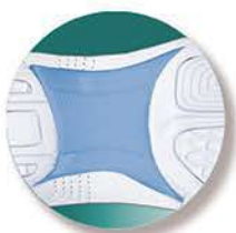
Tuned Torsional Outsole Bridge.