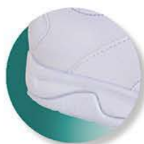
Sleeker midsole with better grip.