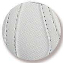
100% tactile Micro-hide upper

Women's Sizes: 4-11, 12, 13, 14 Youth Sizes 10, 11, 12, 13, 1, 2