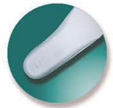
Removable eva insole.

Patented Snap-In™ dual color logos in every box; 15 colors create 120 color combinations.