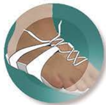
Secure-Fit provides better fit and comfort.