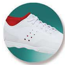
Ventilation and color change.