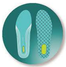
APX heel inset and resilient polyurethane foam insole.